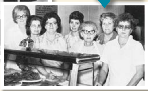
Hot Lunch Staff