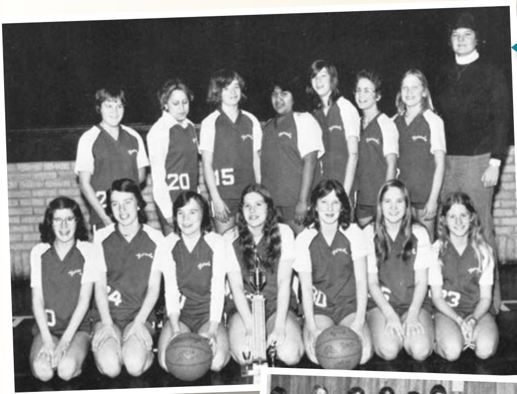
St. Matthew's girls basketball team were named City Champs.