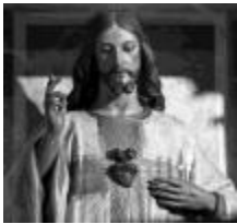
The Most Sacred Heart of Jesus June 11, 2021