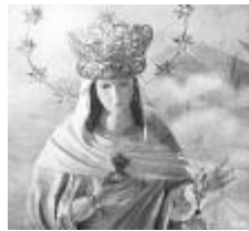
The Immaculate Heart of Mary June 12, 2021