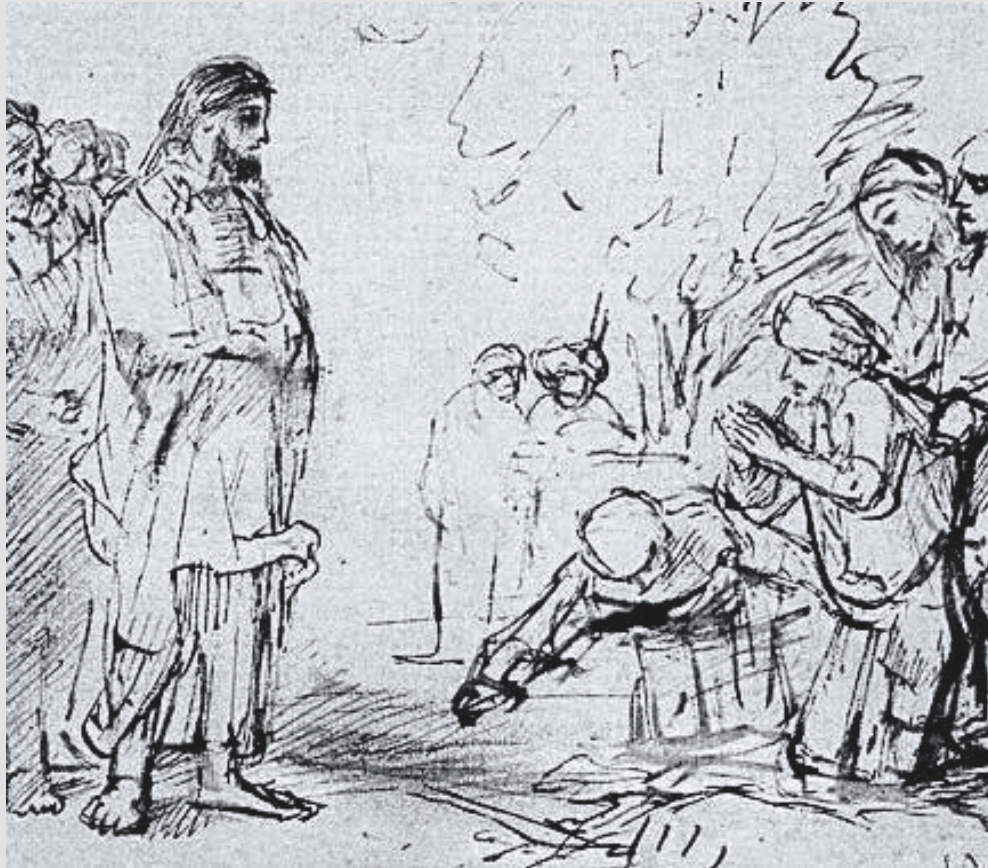
A leper came to Jesus and kneeling down begged him and said, "If you wish, you can make me clean."

A Catholic community that is a visible expression of God's love