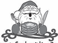
Breakfast With Santa

Santa Claus is coming to Saint Matthew...that is Breakfast with Santa on Sunday, December 10th. There will also be the Rosary/CCW Bake Sale . Full details in the coming bulletins. Circle your calendars, plan to attend, fun for all!