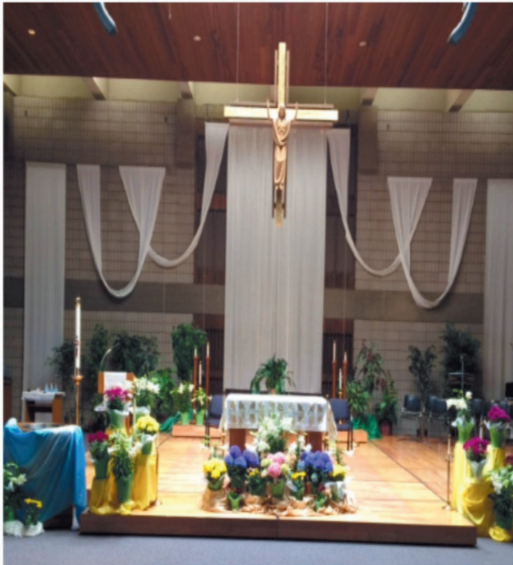
Ascension of the Lord

A Catholic community that is a visible expression of God's love